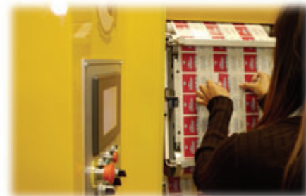
Operator in seating position.