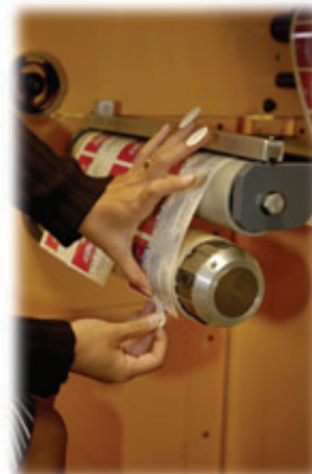
Pre-adjustment of the web on the rewind mandrel.