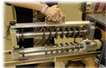
Very easy set up of slitting knives.