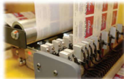
Possibility to read and detect clear on clear labels.